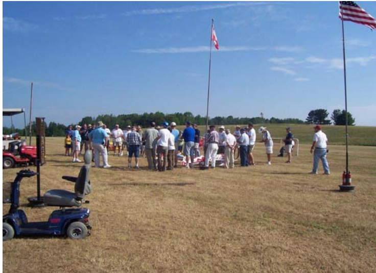
Another morning pilots' meeting goes into history...