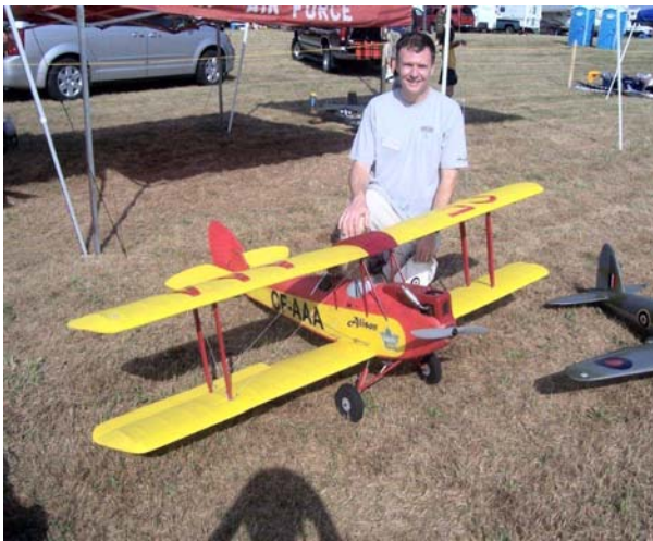
This beautiful Canadian Gypsy Moth seems to make the Rally every year