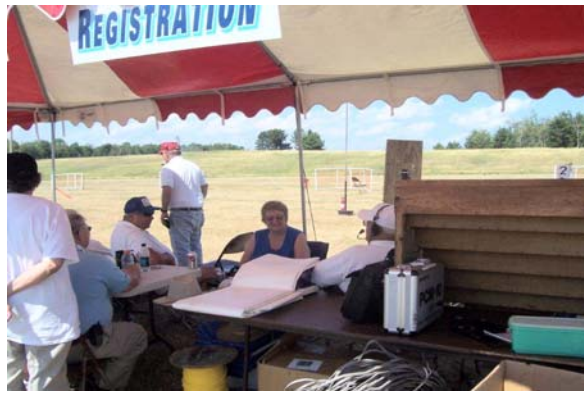
The registration tent always attracts lots of people