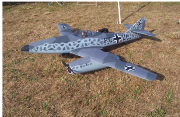
A truly gorgeous Messerschmidt 262!