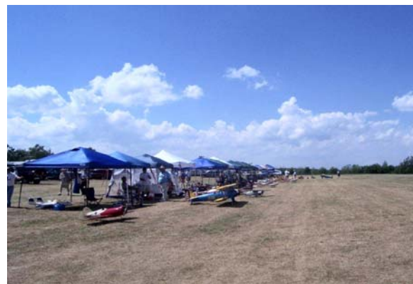
What beautiful weather we had this year!