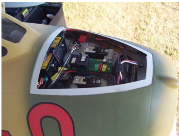
A look at some of the "guts" of that MiG15 turbine jet we had at the Rally.