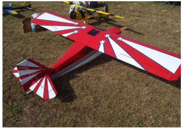
A very nice Decathlon at the Rally.