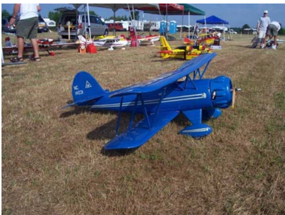
It's difficult to surpass a Waco for all-around good looks.