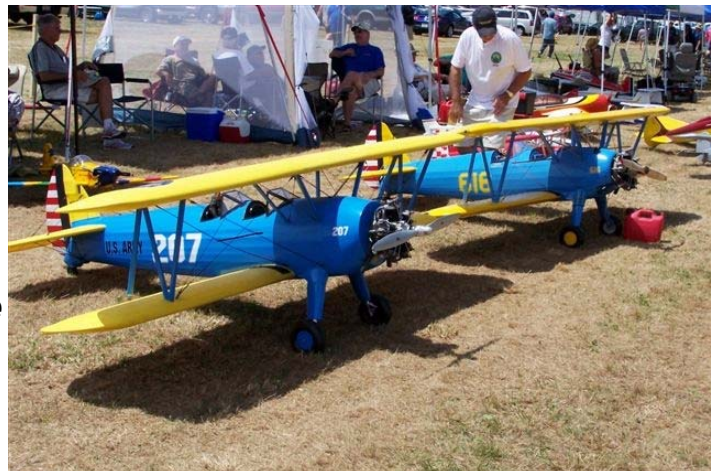
Two of the three beautiful 1/3rd scale Stearman PT-17s we saw fly in formation both days of the Rally. Belonging to our Canadian friends, they are breathtaking to behold in the sky!