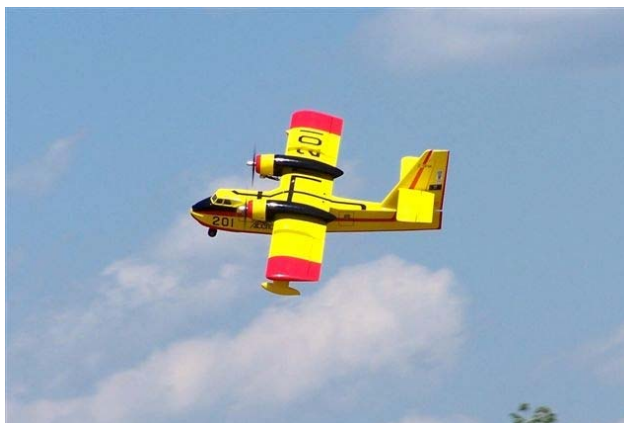
This brightly colored and easy-to-see Canadair was another Canadian visitor to this year's Rally.

HAVE YOU EVER... dropped a small part in the grass at your feet, and then spent the remainder of the daylight hours trying to find it?