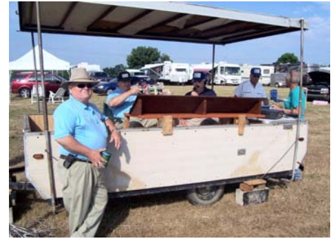
A trio of photos, courtesy of Dick Say, showing a few of the participants in this year's 33rd Annual STARS Scale Rally