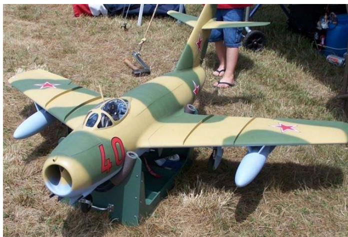
A gorgeous and very fast MiG 15, as seen at the 2010 STARS Rally. Another “Half-time Show” presenter, this plane really wowed” the crowd!

The best landing procedure is to hold the aircraft off the deck a foot high with idle power and try “not to land.” The airplane will slow and “sink in” in spite of you, giving you a smooth transition from air to ground. →