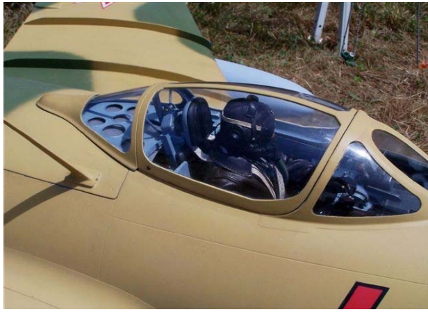
Here's a view of the Cockpit of that beautiful MiG... almost looks real, doesn't it?

The Food tent is ready to go and we have our