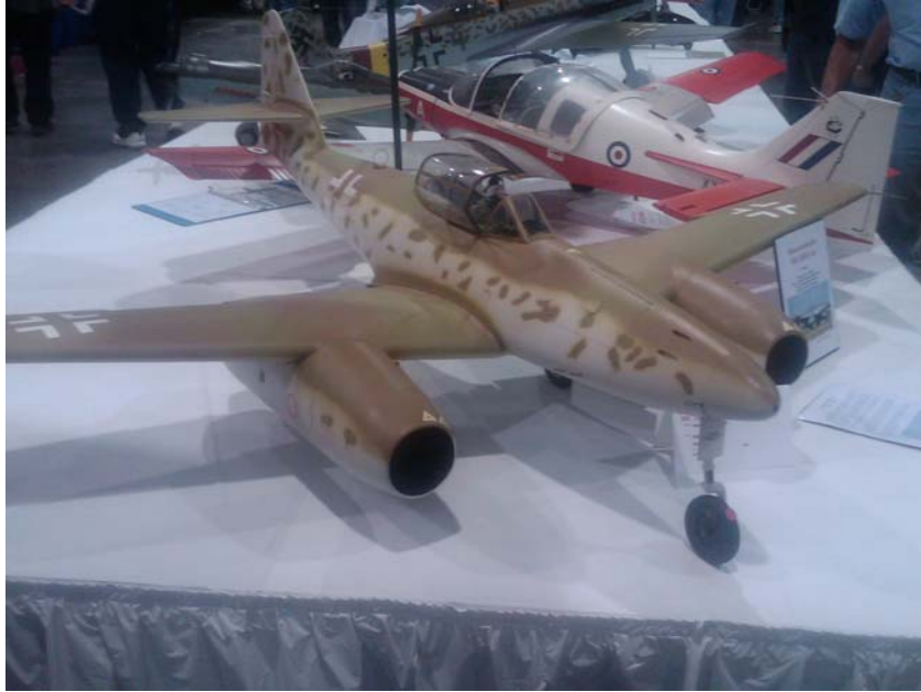
A very nicely finished Messerschmitt 262 at the Toledo show. Immediately behind it, the "very seldom modelled" Scottish Aviation Bulldog Mark I trainer.