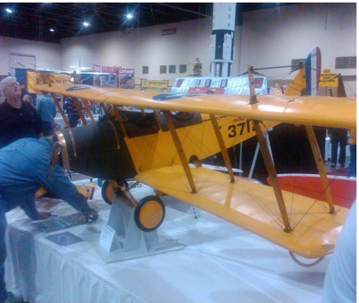
A beautiful Curtiss Jenny on the judging table at the Weak Signals Show, Toledo.