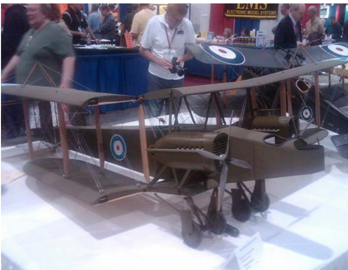
A very large British Hadley Page WWI bomber, with wings that fold back along the fuselage.

HAVE YOU EVER... Changed glow plugs, and found out later that you mistakenly put the old one back in?!?