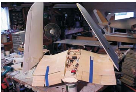
Wings in folded position