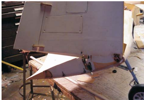
Wing Fold hinges