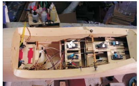
Fuselage Center Section with all servos, wiring not completed