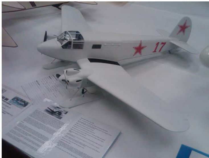
Gary Fitch sent me these two photos of a Tom Hunt modeled Yak-6 he saw at the WRAM show in February.

Building will need to be stained again. Gary F. sug-