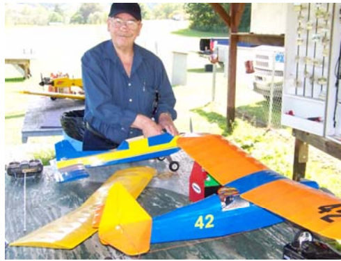
Now, there's a happy looking fella, if I ever saw one!