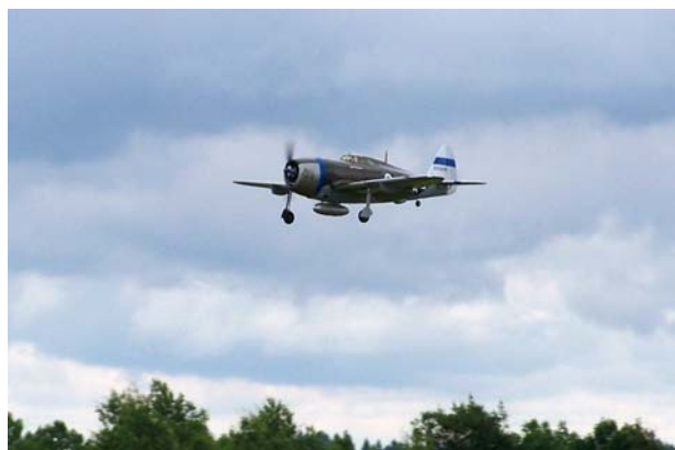
I can’t remember the owner’s name, but this is his beautiful razorback Republic P-47 thunderbolt or “Jug” on final. This giant scale model has a belly drop tank that really “drops”!