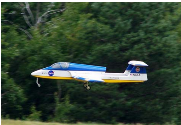
Paul Weigand’s Boomerang Jet with Jet-Cat turbine on a low pass. Paul says it’s been clocked at 160mph!