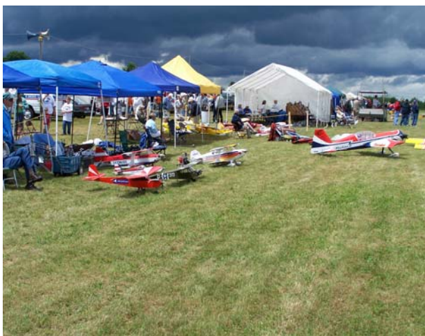
A view of Saturday’s black clouds. The WASPS (Wellsville Area Small Plane Society) pit area is in the front of the picture.