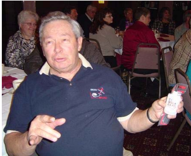
A happy raffle winner with his "goodies"!

What can one possibly say about these two gentlemen? They both are certainly pillars of this organization, and it's almost impossible to imagine it without them. Congratulations to both of you- and a very well deserved "Thank You" for all you do!