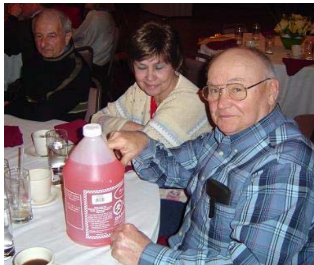
... And yet even another!!!