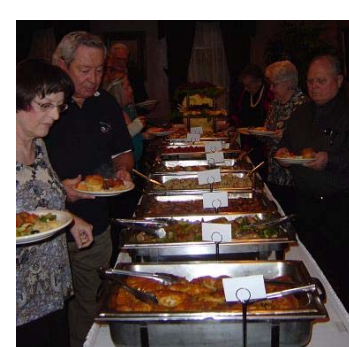
What a spread... it took eight chafing dishes to hold it all!