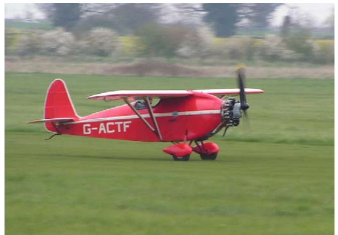
1930's era Comper Swift