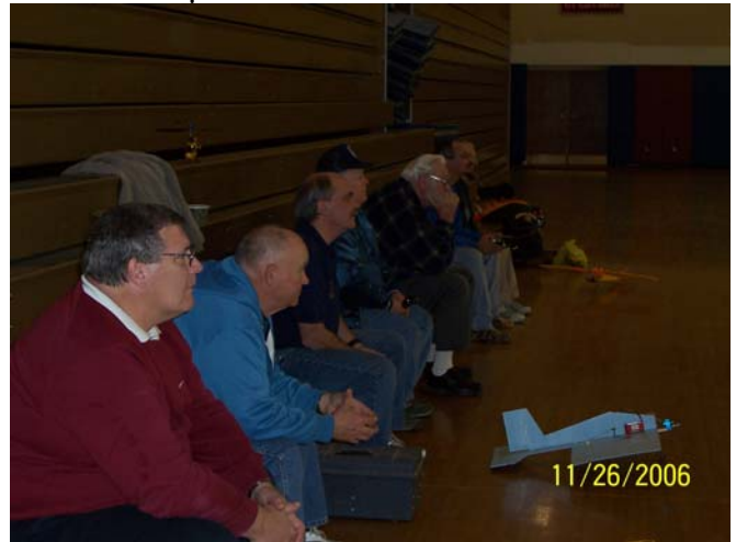
Indoor Flying has begun