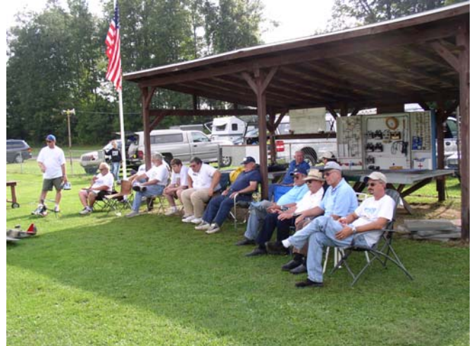
Memories from a recent warmer, happier time.