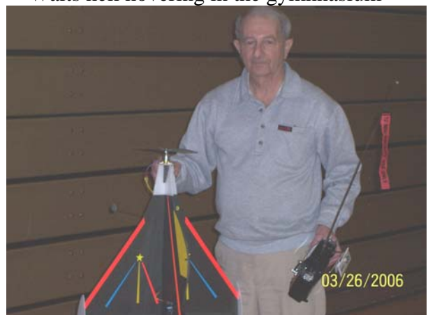
Charles' delta - yes it make a fine indoor flier!