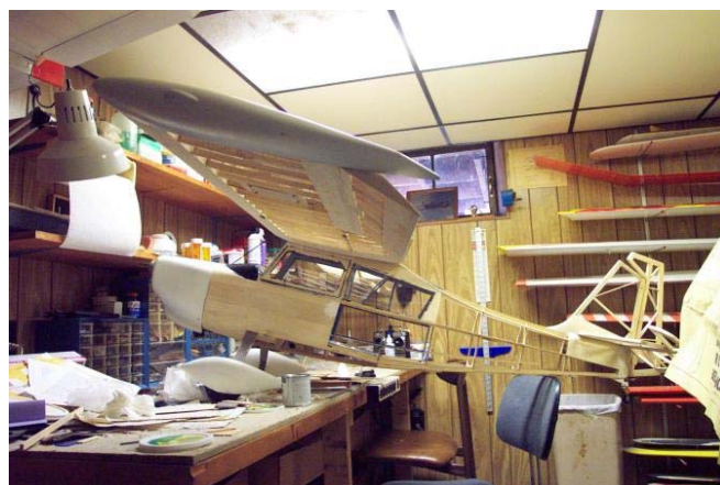
Dave Pratts Decathlon in progress

The next general meeting will be on April 12 th , at JCC at 7:30