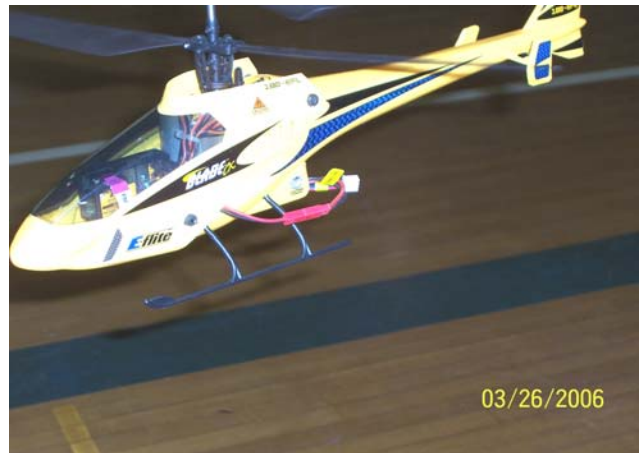
Walt's heli hovering in the gymnasium

Show & tell - Don't forget that if you bring an item for show & tell you automatically receive a free raffle ticket.