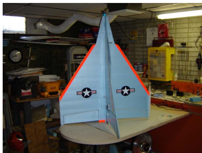
Charlie Scholeno's new "foamie" - interesting.!

That's it folks. If I forgot anything or offended anyone - fire me - please!!!