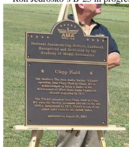
AMA AWARD TO STARS