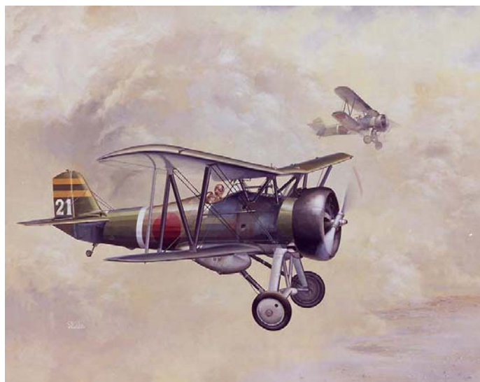
Golden Age Aircraft Nakajima A4N1

All the persons nominated accepted the nominations.