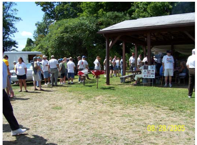
LET'S EAT!!! OPEN HOUSE 2005

That's all we have room for this month folks. I hope you enjoy it. If you find my efforts don't meet your expectations – FIRE ME!!! PLEASE!!!