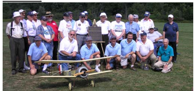
STARS OPEN HOUSE 2005

Thanks to the STARS members and their wives who contributed to this very special occasion.