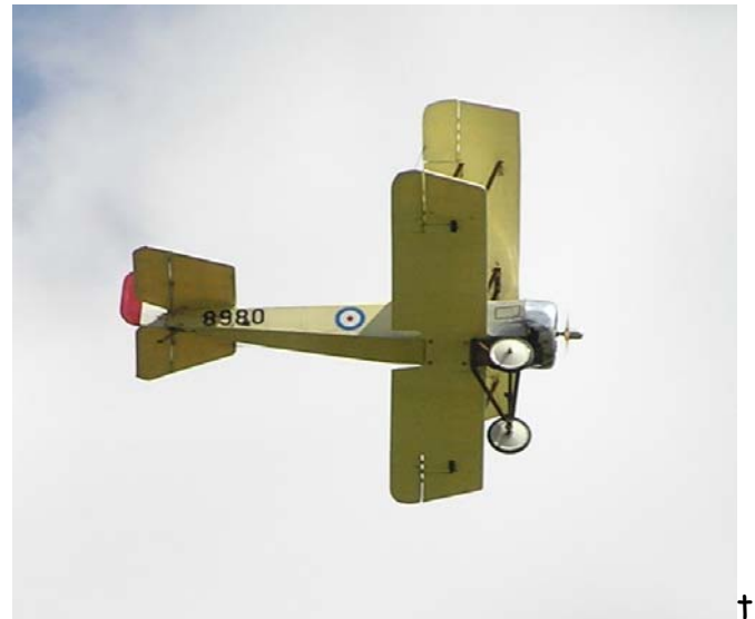
QUARTER SCALE BRISTOL SCOUT AT STARS OPEN HOUSE

As Newsletter Editor I have decided to include these brief notes on Planning Committee meetings in each newsletter, if there are no objections.