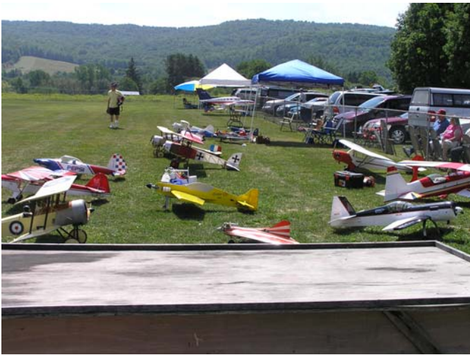
View of the open house flightline - south