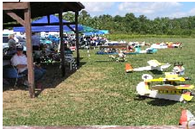
View of the open house flightline looking north.