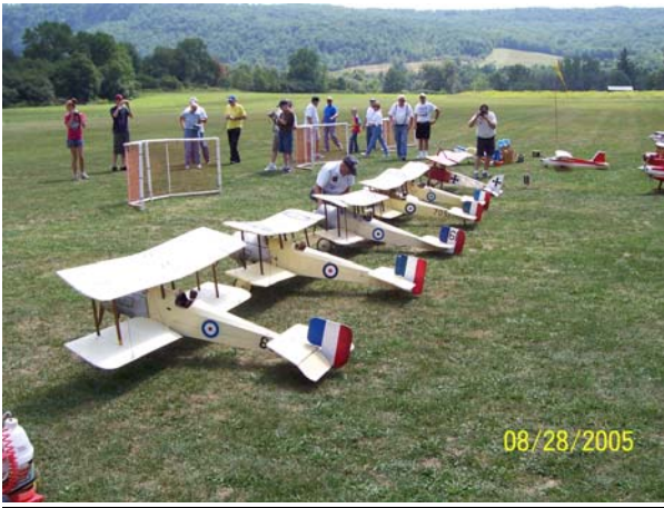
The Bristol Scouts and Pfaltz.