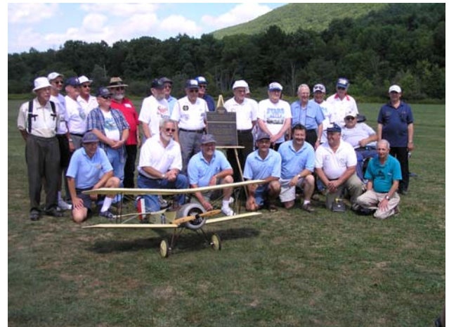
STARS membership, officers, plaques and Bristol Scout.

There will be more coverage including pictures of this years STARS OPEN HOUSE AND AWARDS CEREMONY in the next 2 newsletters. There was just too much information to be contained in one newsletter.